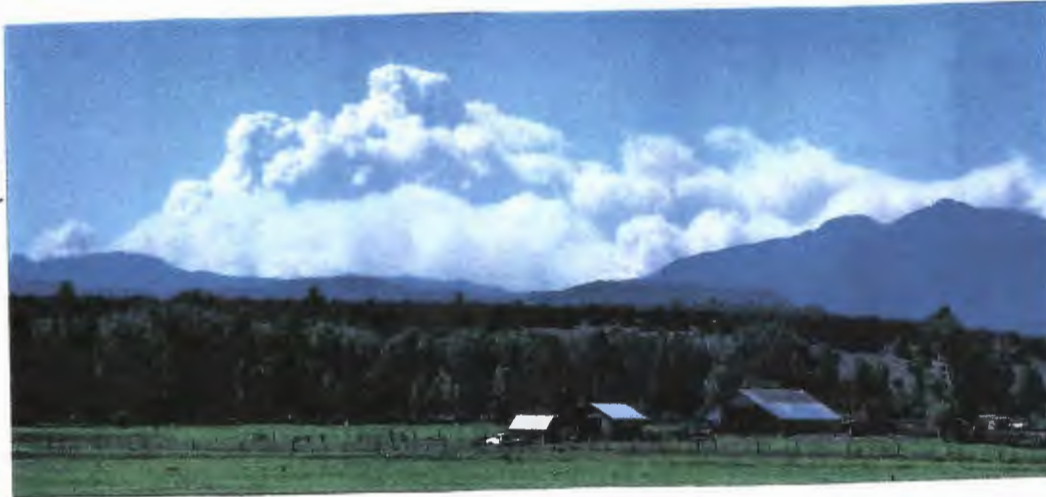
Bottom photo: Navajo Peak area, headwaters of Little Navajo and Navajo Rivers, which feed the San Juan-Chama Project 4/29/13

Water "rights" = paper in an otherwise empty glass when there is no water