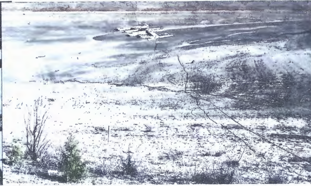
Top photos: left photo taken 4/6/13, right photo taken 4/29/13