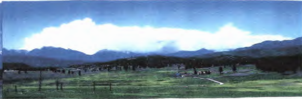
Top left photo: San Juan Mtns. north of Pagosa Springs, CO 4/29/13